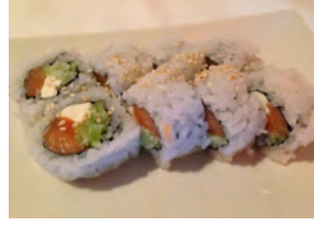
Philadelphia Roll 7.95 Smoked salmon, cream cheese, cucumber, and sesame seeds outside.