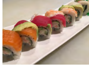
* Rainbow Roll 11.95 California roll topped with fresh fish. * Spicy Tuna Rainbow Roll 12.95 Spicy tuna topped with fresh fish.