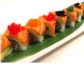
* Atlantic Roll 13.95 Inside spicy tuna and cucumbers. Topped with avocado, fresh salmon and Tobiko caviar.