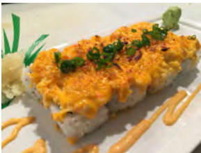
Dynamite Roll 14.95 Shrimp tempura, crab, and avocado inside. Broiled spicy creamy sauce with scallops, crab, lobster meat,