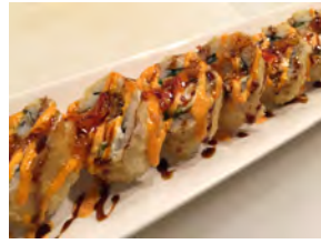
Bangkok Roll 11.95 Fried roll. Shrimp, crab, avocado, fresh basil and cream cheese inside. Thai chili sauce, spicy mayo and sweet soy.