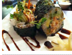
* Salmon Skin Roll 5.95 Crispy salmon skin, avocado, caviar, radish sprouts, and sweet soy.