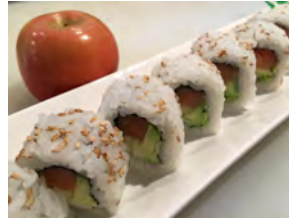
New York Roll 8.95 Smoked salmon, fresh apple, and avocado. Sesame seeds outside.