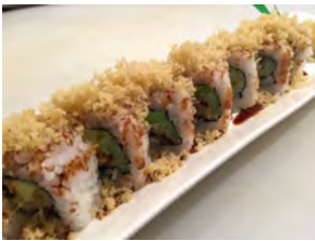
Crunchy Unagi Roll 9.95 Eel, cucumber and avocado. Tempura flakes and eel sauce on top.