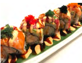
* Godzilla Roll 14.95 Tempura shrimp, spicy carb and cucumbers inside. Topped with sliced avocado, salmon, tuna, spicy mayo, and eel sauce and Tobiko caviar.