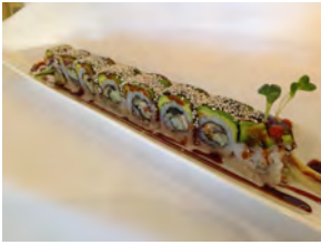
Caterpillar Roll 11.95 Eel and cucumber wrapped with avocado, unagi sauce.