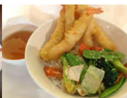
Tempura Shrimp Don