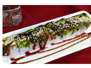
914 Roll 14.95 Cooked Lobster meat, shrimp tempura and avocado rolled uramaki style, wrapped with eel. Drizzled with eel sauce and sesame seeds.