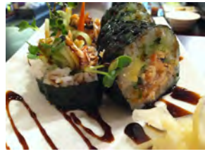
* Salmon Skin Roll 5.95 Crispy salmon skin, avocado, caviar, radish sprouts, and sweet soy.