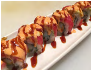
* Dancing Dragon Roll 13.95 Shrimp tempura, caviar and cucumber inside. Topped with Tuna, avocado, spicy mayo and eel sauce.