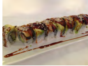
* Ichiban Roll 12.95 Yellowtail, cucumber and avocado, topped with baked eel, avocado and eel sauce.