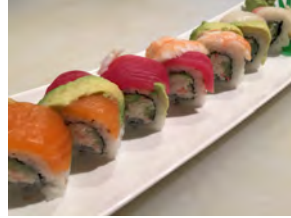
* Rainbow Roll 10.95 California roll topped with fresh fish. * Spicy Tuna Rainbow Roll 12.95 Spicy tuna topped with fresh fish.