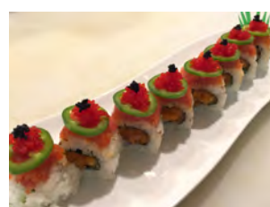
* The Mean Moose 12.95 Spicy salmon inside. Spicy tuna, fresh jalapeño and caviar outside.