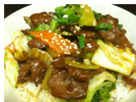
Beef Teriyaki Don

($2.00 minimum will be charged for any substitution)