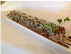
Caterpillar Roll 10.95 Eel and cucumber wrapped with avocado, unagi sauce.