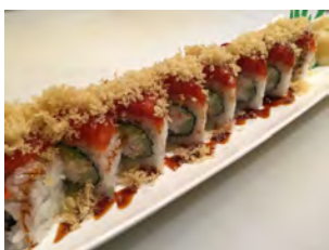
* Rising Sun 12.95 Crab, avocado, and cucumber inside, topped with spicy tuna, eel sauce, and tempura flakes.