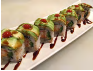
Caliente Roll 8.95 Crab, jalapeño, sriracha inside. Avocado, sweet soy & sriracha sauce outside.