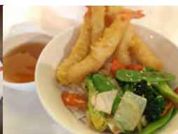
Tempura Shrimp Don