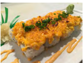
Dynamite Roll 14.95 Shrimp tempura, crab, and avocado inside. Broiled spicy creamy sauce with scallops, crab, lobster meat,