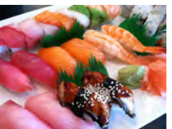
Sushi & Sashimi