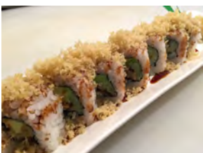
Crunchy Unagi Roll 9.95 Eel, cucumber and avocado. Tempura flakes and eel sauce on top.