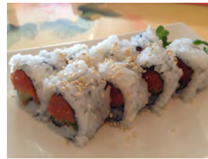
* Spicy Tuna Roll 5.95 * Spicy Salmon Roll 5.95 * Spicy Hamachi Roll 5.95