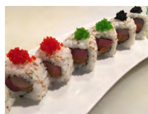
* Tokyo Roll 10.95 Tuna, yellowtail, salmon inside. Caviar and sesame seeds outside