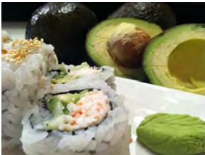
California Roll 5.45 Kanikama crab, avocado, cucumber, topped with sesame seeds.