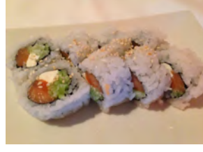
Philadelphia Roll 6.95 Smoked salmon, cream cheese, cucumber, and sesame seeds outside.