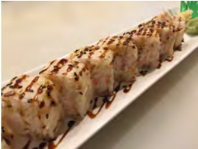
Crab Rangoon Roll 8.95 Kanikama crab, cream cheese, and tempura flakes. Wrapped in soy paper. Sesame seeds, and sweet soy outside.