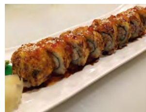
Vegas Roll 10.95 Inside salmon, crab, avocado and cream cheese. Fried in tempura batter. Outside topped with sweet chili and sweet soy. Fried roll.