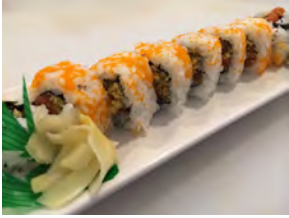
* Boston Roll 9.95 Spicy lobster, avocado, cucumber and caviar outside.