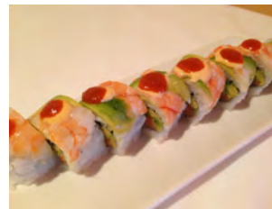
Southwest Roll 12.95 Inside smoked salmon, green chili, cucumber. Outside shrimp, avocado, spicy sauce.