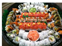
Sample Sushi Platter

Assorted sashimi on a bed of sushi rice, egg custard, seaweed and sesame seeds.