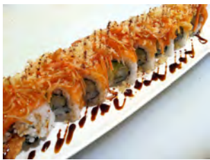
* Rock-N-Roll 13.95 Shrimp tempura, avocado, and cucumber inside. Fresh salmon, tempura flakes and eel sauce on top.