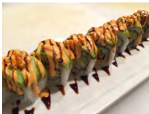
* Picasso Roll 12.95 Shrimp tempura, cucumber, and caviar inside. Avocado, eel sauce, spicy caviar mayo, sesame seeds outside.