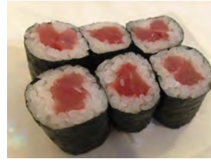
(6 pieces cut) * Tuna Roll 5.95 * Salmon Roll 5.95 * Hamachi-Maki 5.95