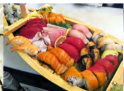
Sample Assorted Sushi