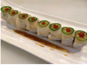
* Baja Roll 12.95 Inside spicy tuna, outside white tuna, Ponzu sauce and sliced jalapenos.