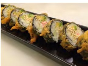
Fried California Roll 6.95