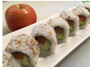
New York Roll 8.95 Smoked salmon, fresh apple, and avocado. Sesame seeds outside.