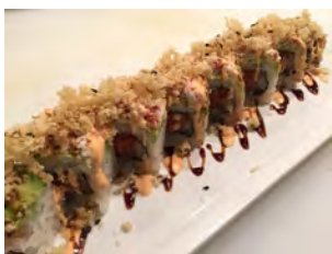
* Ninja Roll 13.95 Spicy tuna, cucumber, topped with avocado, crab, sweet soy, spicy mayo, and tempura flakes.