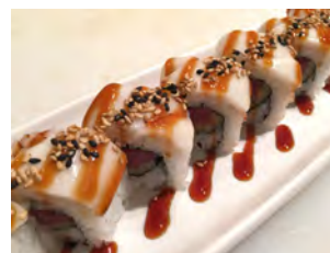
* Snow White Roll 12.95 Tuna, caviar and cucumber inside. White tuna, eel sauce and sesame seeds outside.