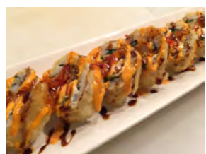
Bangkok Roll 11.95 Fried roll. Shrimp, crab, avocado, fresh basil and cream cheese inside. Thai chili sauce, spicy mayo and sweet soy.