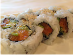
* Alaskan Roll 6.95 Salmon avocado and cucumber.