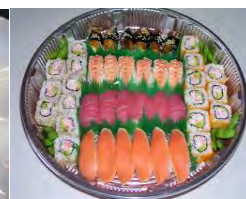
Special order party platter