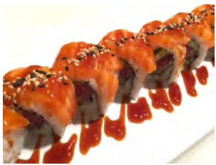
* Lion King Roll 14.95 Fresh tuna, avocado and cucumber inside. Fresh salmon, eel sauce and sesame seeds outside.