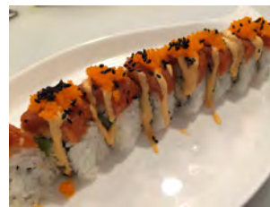
* Volcano Roll 14.95 Lobster, avocado and cucumber rolled uramaki style. Topped with spicy tuna, masago caviar, spicy mayo and sesame seeds.

* Consuming raw or undercooked meats, poultry, seafood, shell fish or eggs may increase risk of food borne illness*