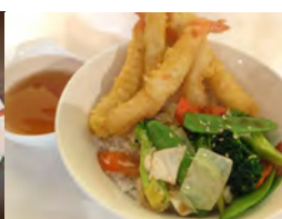
Tempura Shrimp Don