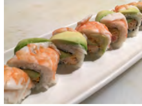
* Shrimp & Lobster Roll 12.95 Lobster meat in spicy mayo and cucumber inside. Topped with cooked shrimp and avocado.