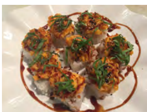
The Diablo Roll 16.95 Spicy lobster meat, avocado and jalapeño inside. Topped with baked spicy lobster, scallop and crab mix. Sesame seeds and fresh basil.